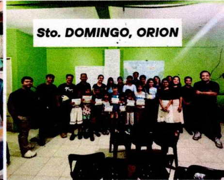
Sto. DOMINGO, ORION