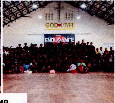
YOUTH CAMP | ENDURANCE CAMP