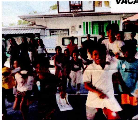
VACATION BIBLE SCHOOL ORION, BATAAN