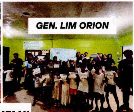
GEN. LIM ORION