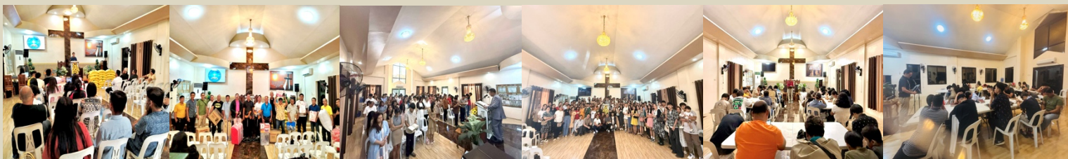
Pastor's & Worker's Fellowship

As we move forward, we humbly ask that you continue to include our building project and the payment of our lot property in your prayers, seeking God's will above all else. May everything be done for His glory, in His timing, and according to His divine purpose. We are truly thankful for your continuous support, faithful prayers, and loving partnership in the ministry. Our hearts overflow with gratitude as we declare how good and faithful our God is. "O give thanks unto the LORD; for he is good: for his mercy endureth for ever" (Psalm 107:1). May the Lord richly bless you, and may His name be forever praised.