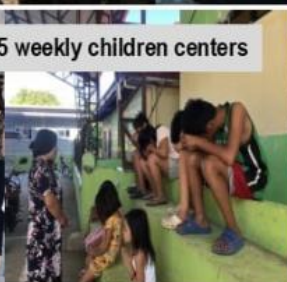
5 weekly children centers