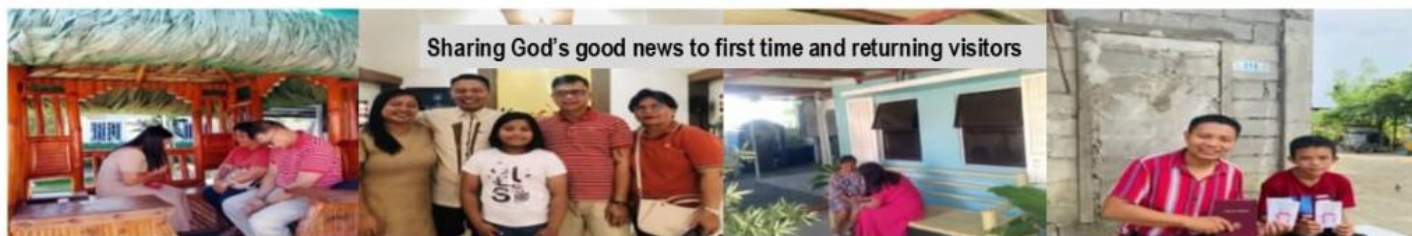
Sharing God's good news to first time and returning visitors