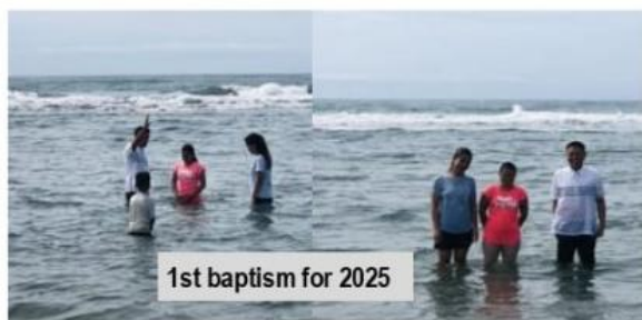
1st baptism for 2025

We thank God Almighty for His goodness and faithfulness for the first 4 months of this year! We started with 2 baptisms in January and then the continuous improvement of our multi purpose gym project at Camp Hope. God also gave us opportunity to minister at 2 funerals and restore 1 children center in Caterman village. We're most grateful for souls won to the Lord during visitations, on our Sunday services and other occasions! We thank Him for using us continuously in His vineyard!