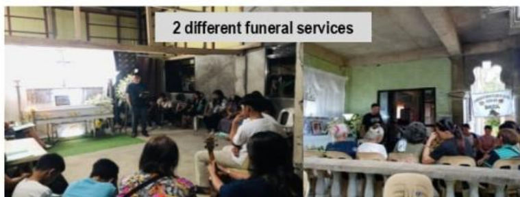
2 different funeral services