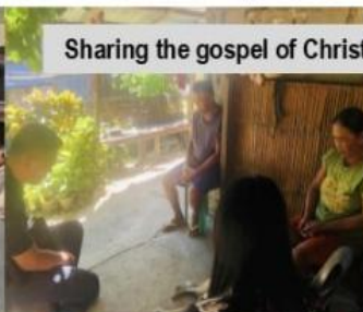
Sharing the gospel of Christ to the lost.