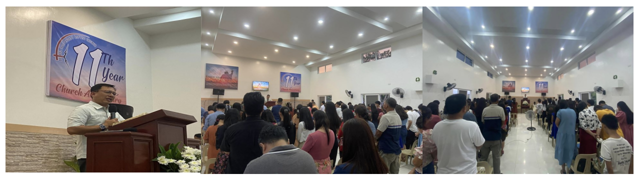
SOUL WINNING AT THE NEW MISSION WORK