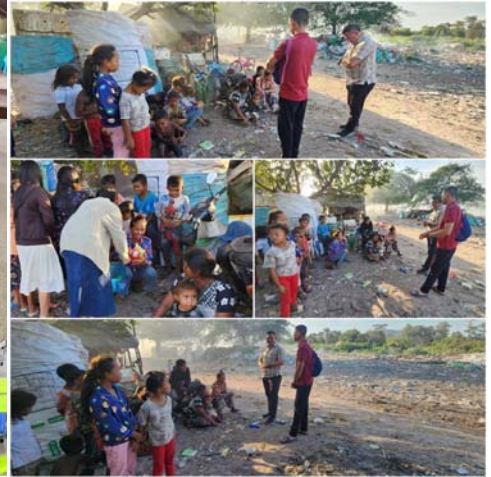
Please help us pray for the children working in the dumpsite. Our heart aches for them.