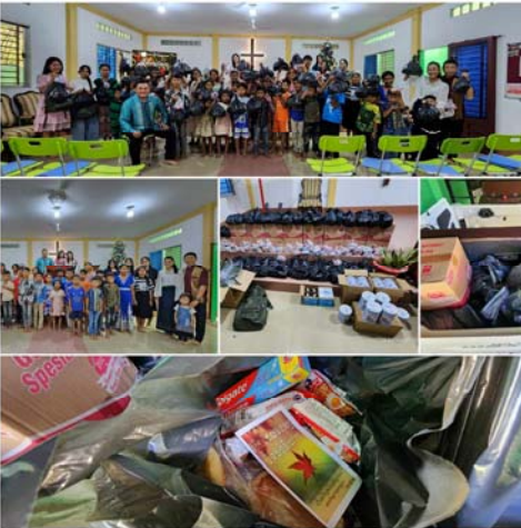
This was our Christmas Celebration in the church. We received blessings from our fellow Christian and were able to share these gifts to our members and neighbors. Praise the Lord!