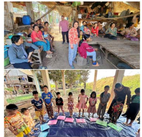
We resumed going to Kampong Ous village. Discipling the adults and teaching the kids.