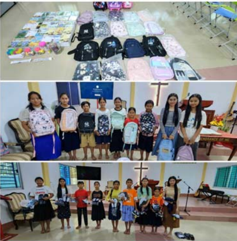
Students who received the school supplies, uniform and slippers.