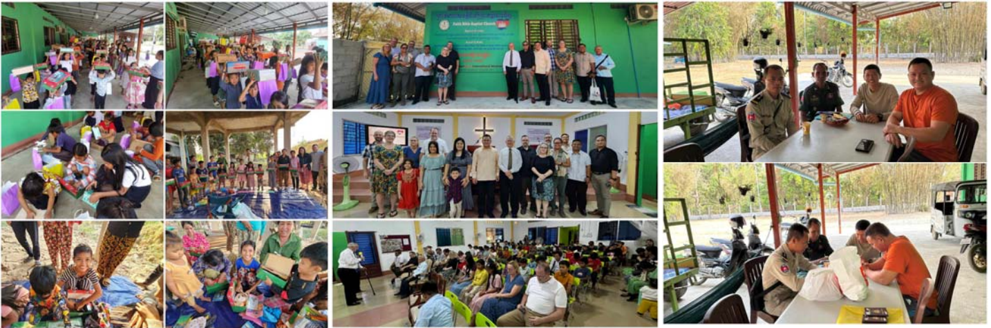
100 kids were so happy to receive shoe boxes from Samaritans Purse. Praise the Lord.