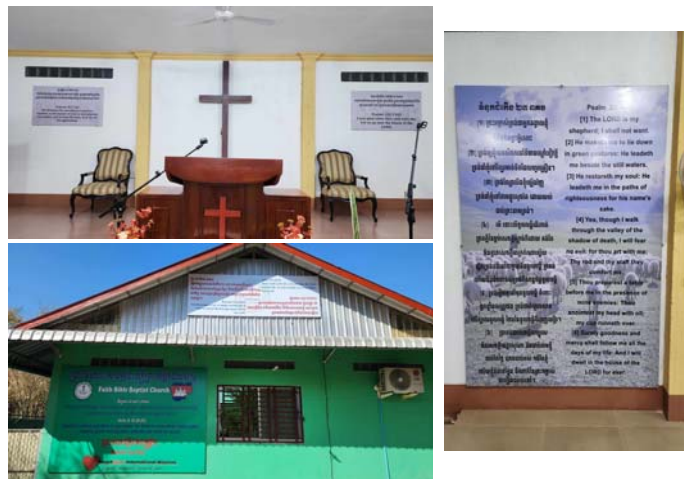
New Church Posters. The main purpose of this is for our young people to familiarize and memorize these verses. Planning to put many more verses. Praise the Lord.