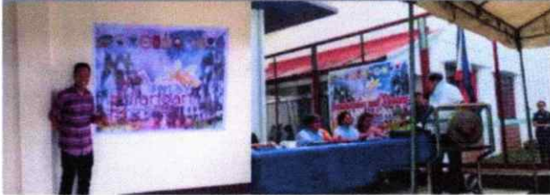
Had the privilege to do a dedication prayer for a newly built rehabilitation facility here in Candon City...

In July, God expanded our horizon through a new ministry called Prison Fellowship Philippines. We not only reach out to people behind bars but also extend to the families of its beneficiaries. We had our very first meeting with them at our church in July 3. We were given the opportunity to share the gospel and we praise the Lord for all who received Him!