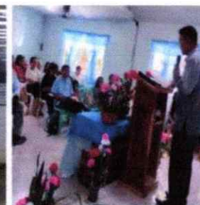
June 18, I was invited to preach at a sister church up on the mountains of Naguillian, La Union..