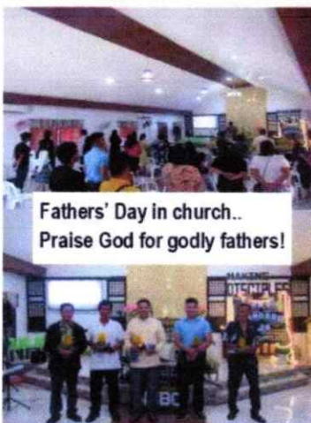
Fathers' Day in church.. Praise God for godly fathers!