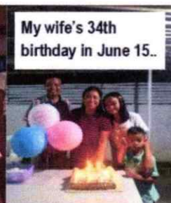
My wife's 34th birthday in June 15..