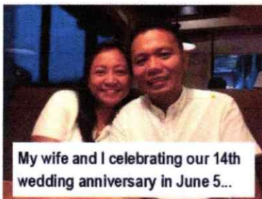
My wife and I celebrating our 14th wedding anniversary in June 5...