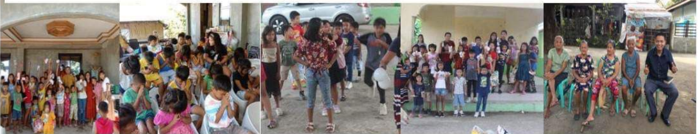
CHURCH CHRISTMAS PROGRAM 2022 Praising God for 1st time & returning visitors.