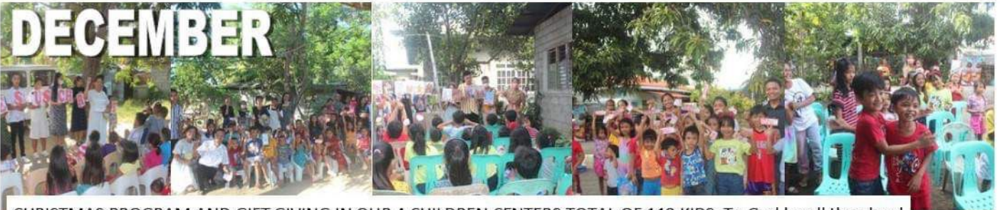
CHRISTMAS PROGRAM AND GIFT GIVING IN OUR 4 CHILDREN CENTERS, TOTAL OF 119 KIDS. To God be all the glory!