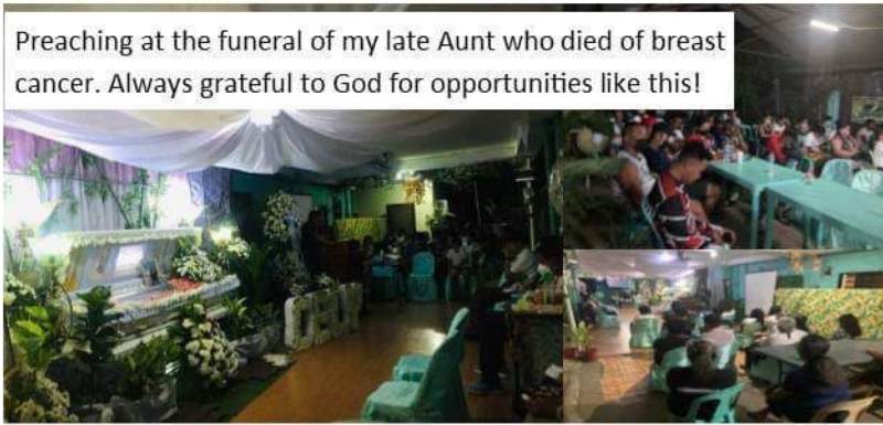
Preaching at the funeral of my late Aunt who died of breast cancer. Always grateful to God for opportunities like this!