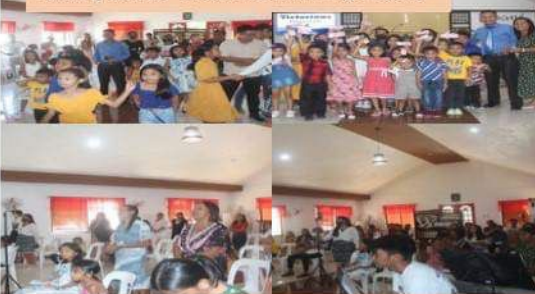
CHURCH CHRISTMAS PROGRAM 2022 Praising God for 1st time & returning visitors.