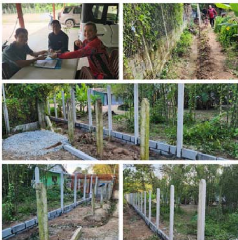
This is the piece of land that we have bought from our neighbor to make way for drainage. We've already put up a fence.