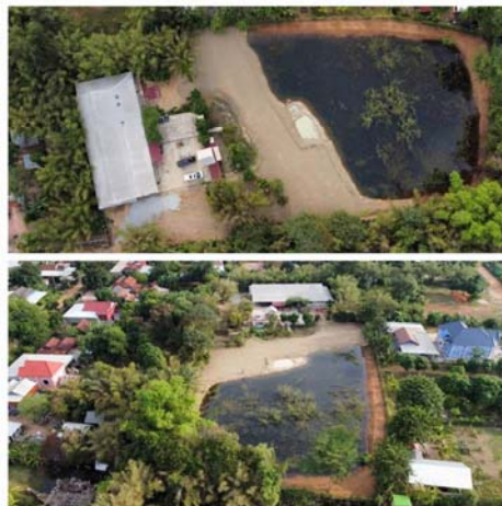
This is an aerial photo of our property. We just need to fill up some parts to balance the shape and leave an open area for a fishpond.