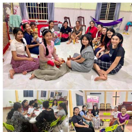
Ladies Bible Study/Fellowship every last Saturday of the month.