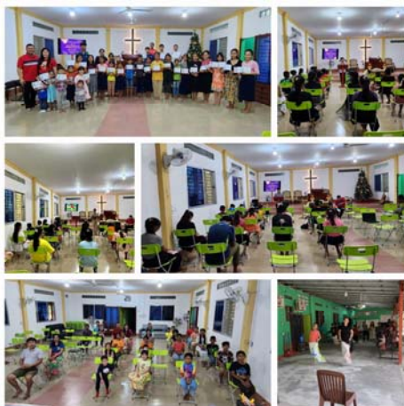
3-Day Vacation Bible School.