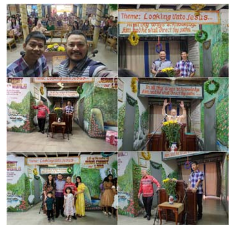
My dad invited me to preach on their 19th Church Anniversary on December 18th.