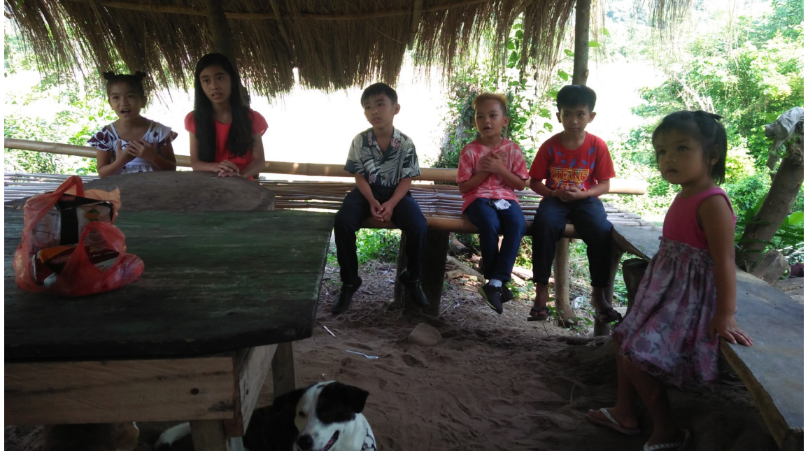
MAKING LETTERS FOR MOTHER"S DAY SPECIAL

OUR SUNDAY SCHOOL CHILDREN AT THEIR NEW ENVIRONMENT